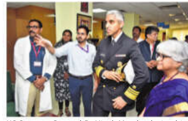
US Surgeon General Dr Vivek Murthy during his visit to Bengaluru

He mentioned that many medical curricula have not adequately addressed mental health issues, noting that for too long, mental and social