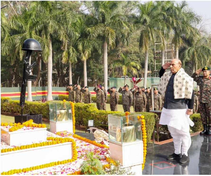
The Union Minister for Defence, Rajnath Singh laying a wreath and paying homage to the bravehearts at the Infantry Memorial, in Mhow, Madhya Pradesh on Monday.