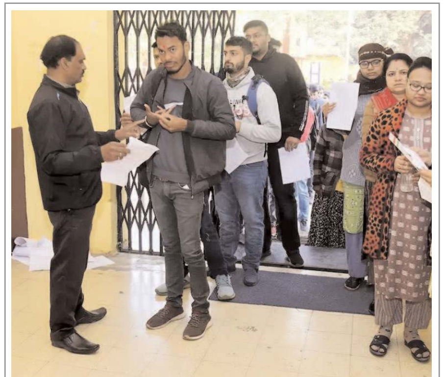
Candidates get their documents checked as they arrive to appear for the Madhya Pradesh Public Service Commission (MPPSC) exam, at an examination centre in Jabalpur.