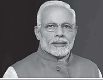
नरेंद्र मोदी प्रधानमंत्री

Sd/- Authorized Officer For L&T Finance Limited