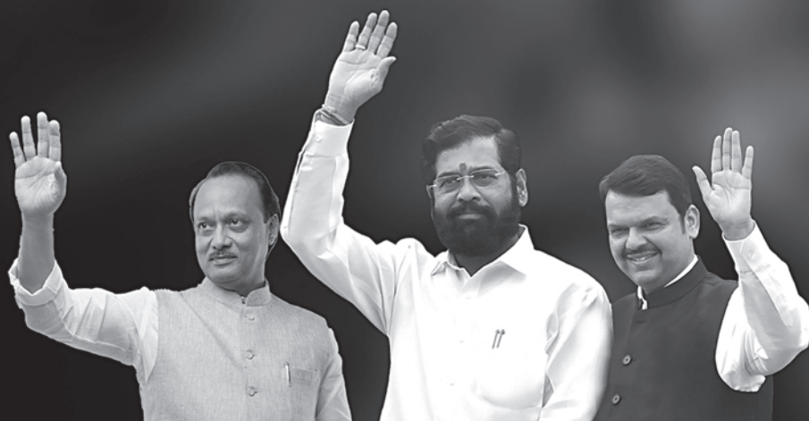
अजित पवार उपमुख्यमंत्री

मुलीच्या जन्मास प्रोत्साहन व शिक्षणास चालना वय 18 वर्षे पूर्ण होईपर्यंत 1 लाख 1 हजार रुपयांचा लाभ आतापर्यंत १ लाख १७ हजार ३९० लाभार्थ्यांना १७ कोटी ४० लाखाचा निधी वाटप