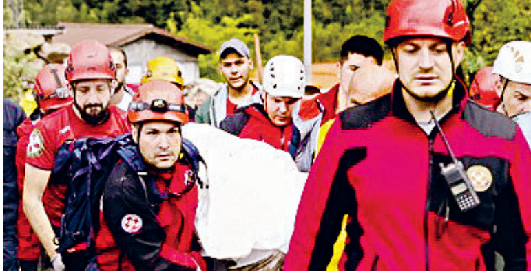
Teams from European Union countries join efforts to clear the rubble and find missing people on Sunday.