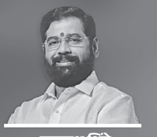
एकनाथ शिंदे मुख्यमंत्री